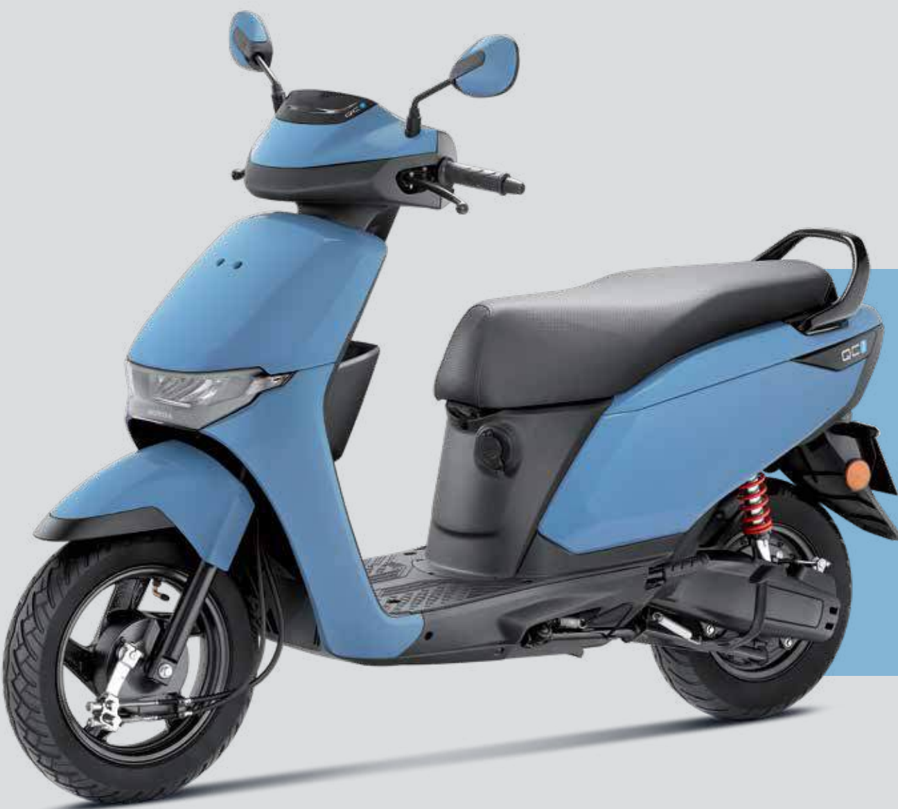
Pearl Serenity Blue

Choose from a range of stunning colours that reflect your personality.