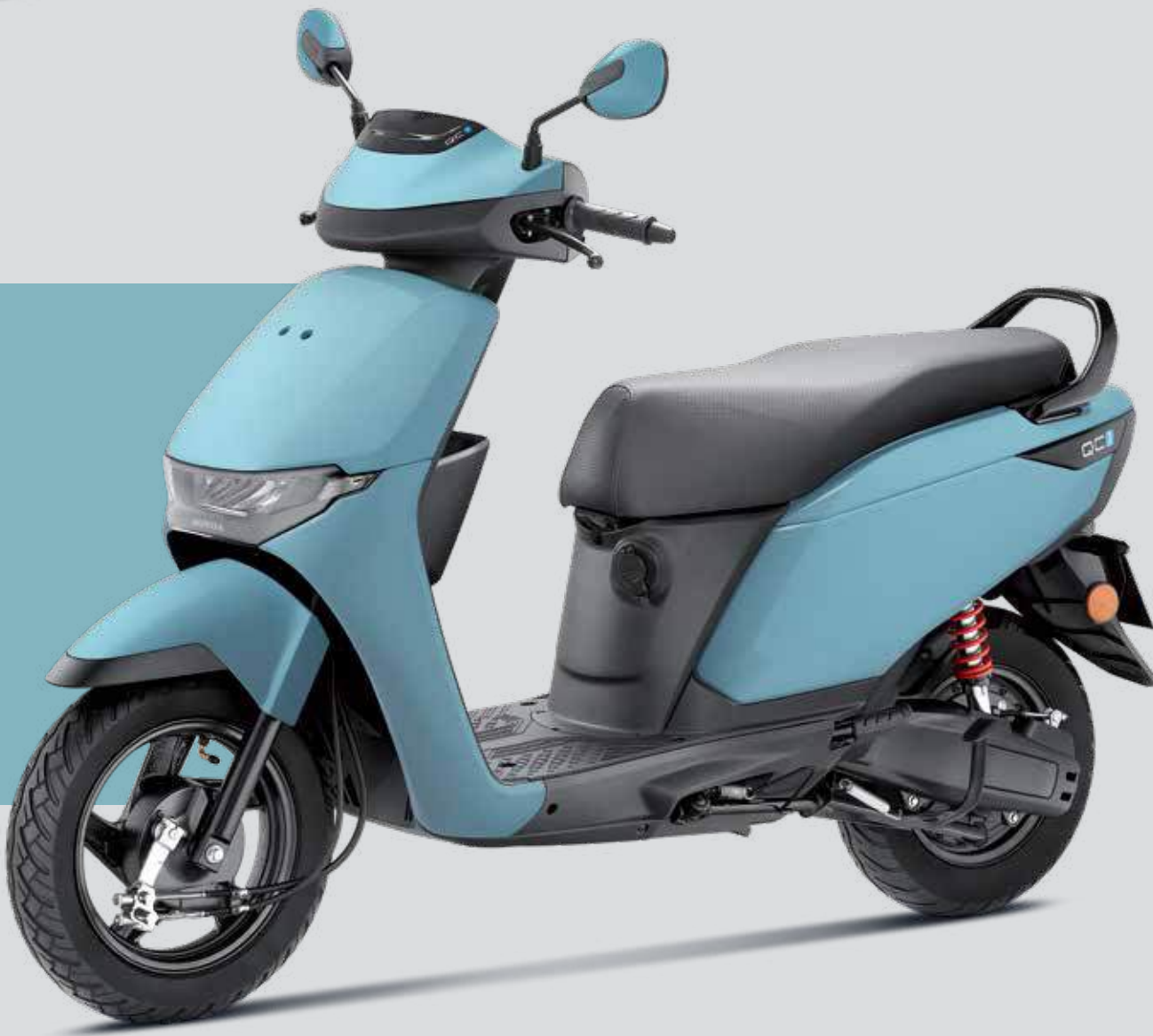
Pearl Shallow Blue