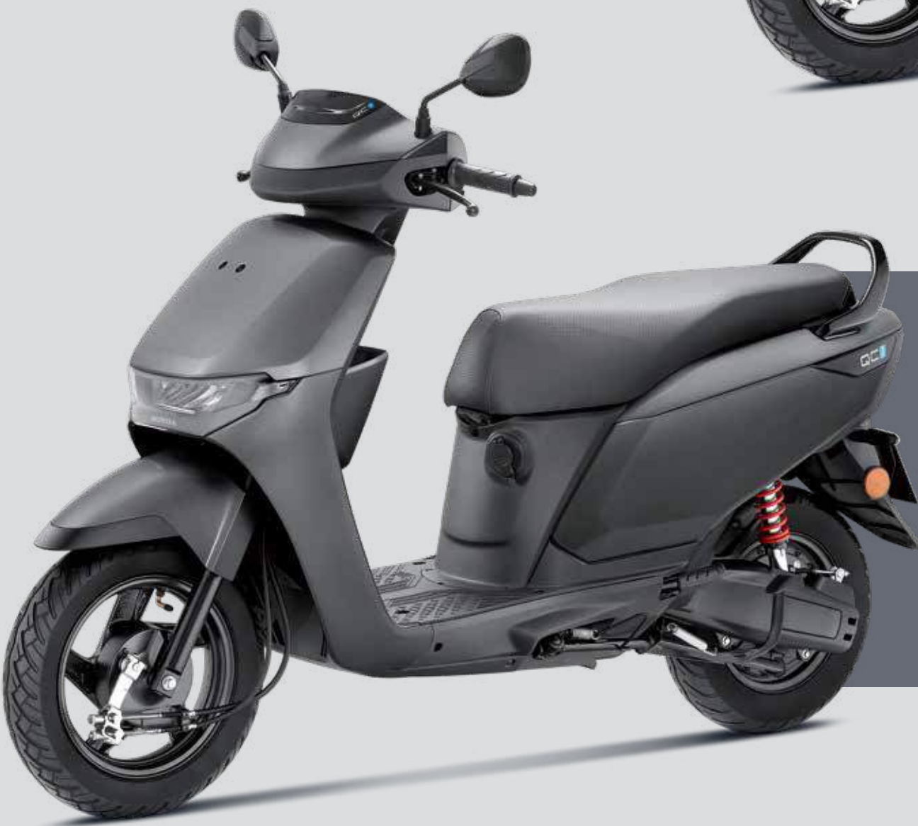
Matt Foggy Silver Metallic