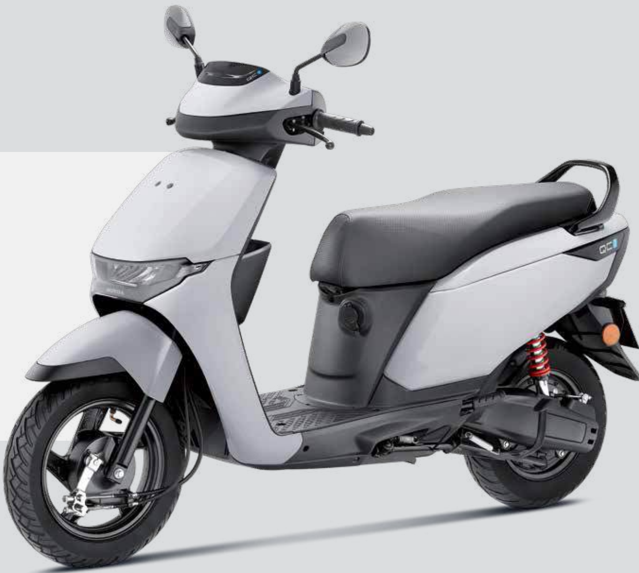
Pearl Misty White